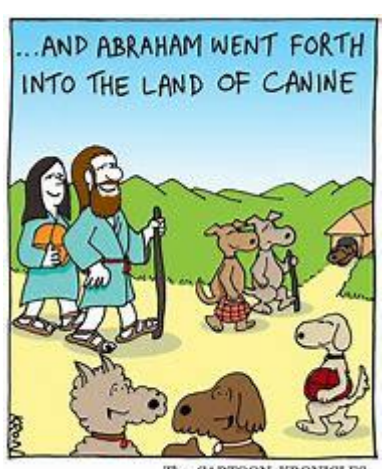
The CARTOON KRONICLES